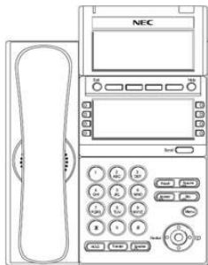
Dual Screen 8 Button

From this key, the user may access additional functions such as Call History and Directory